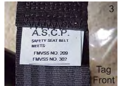
This photo shows the 'front' of the tag.