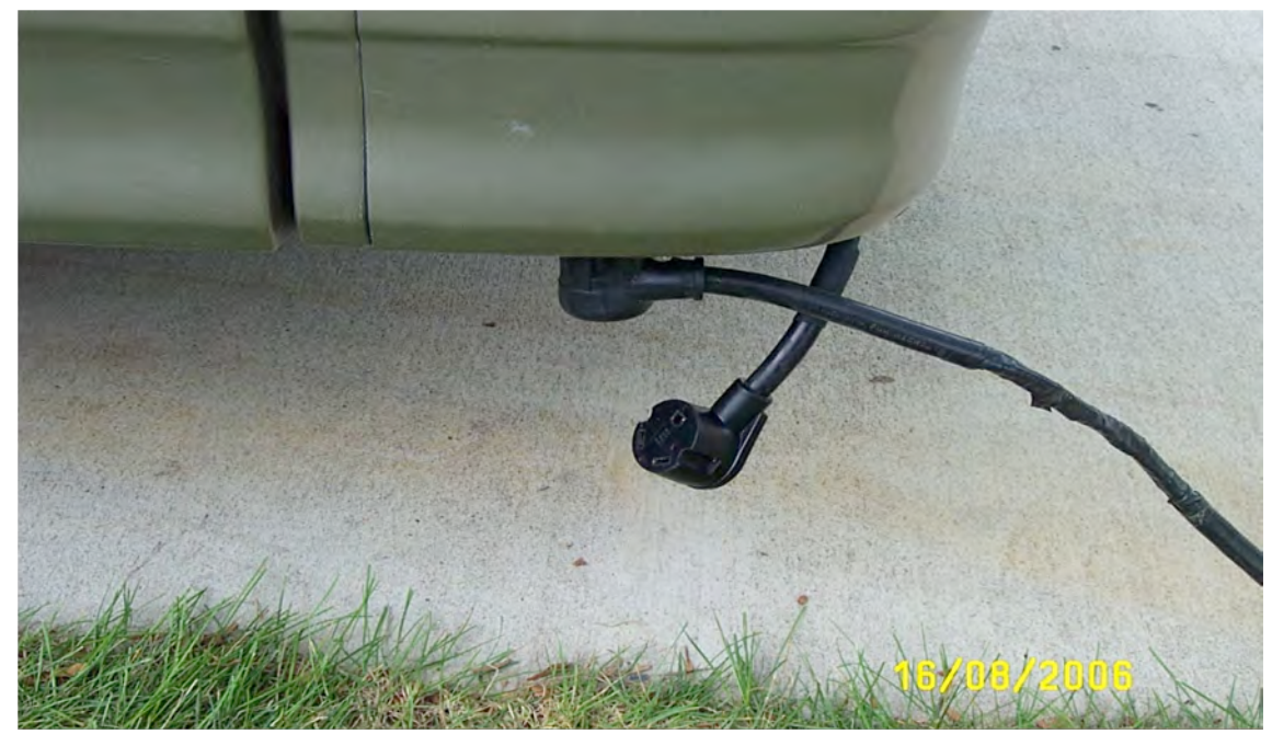
Female 30 Amp plug [that has been fitted to the vehicle end of the severed original shore line cable], attached to the mounted 30 Amp Male plug [not visible]. The 30 Amp cord and Female plug from the generator are hanging down, waiting to be attached when you will leave camp, or for dry camping.